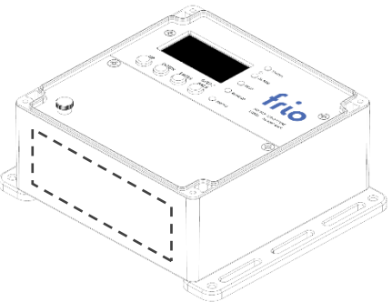
Figure 1: Frio S1 controller showing the bottom side where to drill wiring holes.